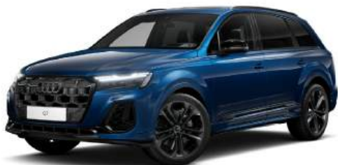
Ascari Blue Metallic