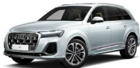
Satellite Silver Metallic