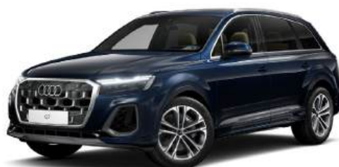
Waitomo Blue Metallic