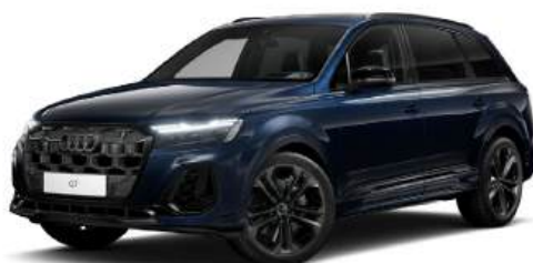
Waitomo Blue Metallic