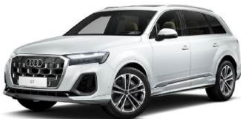
Glacier White Metallic