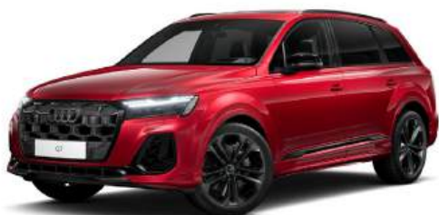
Chili Red Metallic