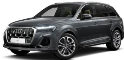
Daytona Gray Pearllescent