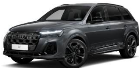
Daytona Gray Pearllescent