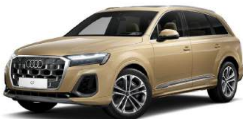
Sakhir Gold Metallic