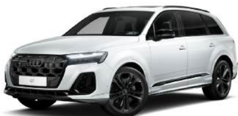
Glacier White Metallic