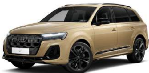
Sakhir Gold Metallic