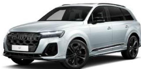
Satellite Silver Metallic