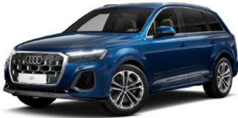
Ascari Blue Metallic