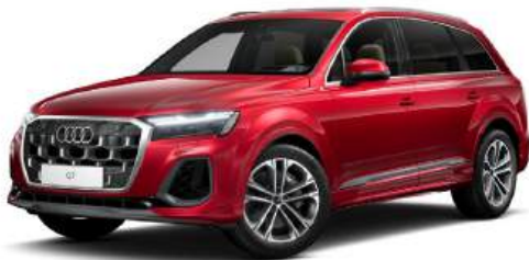
Chili Red Metallic