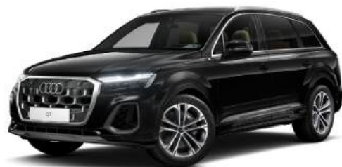
Myth Black Metallic