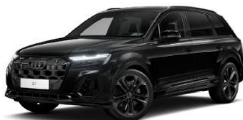
Myth Black Metallic