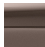
Sunset Copper (Metallic) (Interior only available in Sahara Dune)