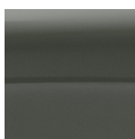
Mineral Green (Metallic) (Interior only available in Black Ocean)