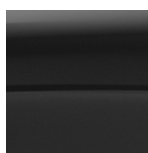
Sparkling Black (Metallic) (Interior available in Black Ocean and Sahara Dune)