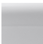
Crystal White (Metallic) (Interior available in Black Ocean and Sahara Dune)